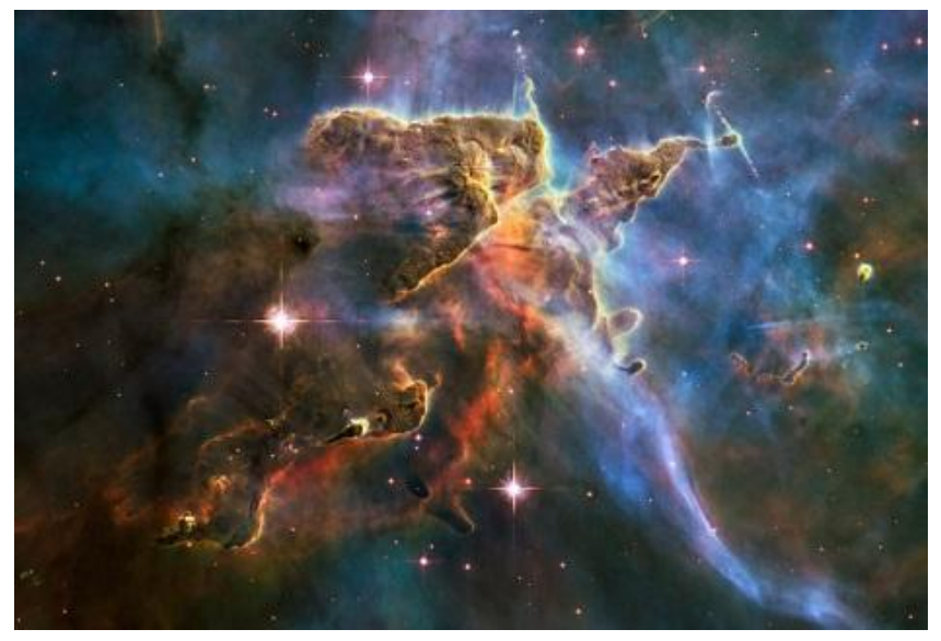
The Carina Nebula OR