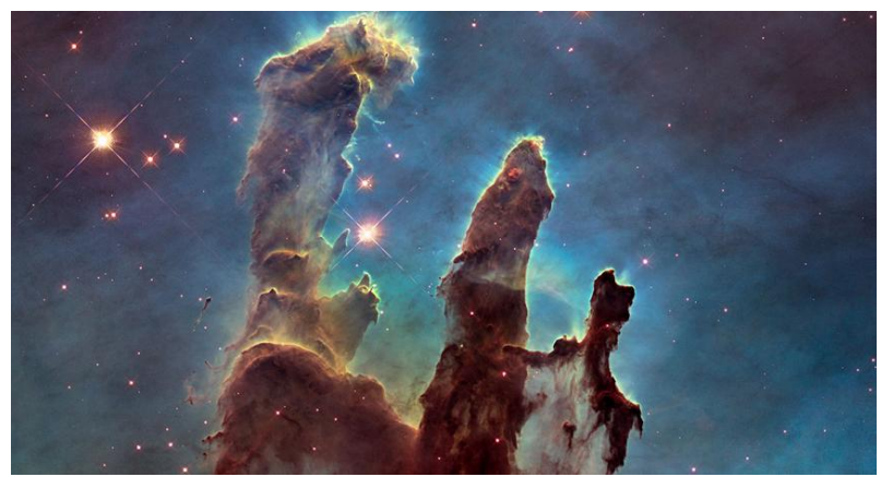
The Eagle Nebula

All the newborns in a nursery cloud are the same shade of H/He pink; they have little to none of any other element (except lithium, and that's a minority, if important to help with initially lighting the